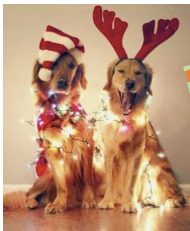
This is a cute pic and all, but please don't wrap your pets in lights like this... no matter how pretty and festive! ☺